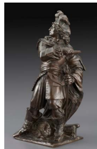
David d’Angers, The Grand Condé , 1817, bronze, private collection

Returning to Paris in 1816, David received his first major commission from the Restoration government. With the death of Roland earlier that same year, he inherited his teacher’s unexecuted contract for a colossal sculpture of Louis de Bourbon, the seventeenth-century French general known as the Grand Condé—an exceptional show of faith in a young and untested artist. David’s half-size plaster model for the statue made its debut at the Salon of 1817, although the thirteen-foot-tall marble (now destroyed) would not be completed for another decade. Breaking with the conventional repose and