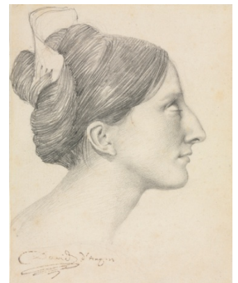
David d'Angers, Head of a Woman in Profile , c. 1830s, graphite on paper, The Cleveland Museum of Art