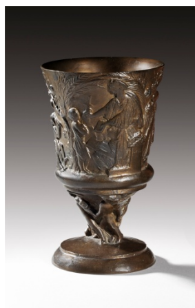
David d'Angers, Christening Cup , model 1835, bronze, collection of Pierre Bergé

David's portrait medallions blur the line between public monument and private objet d'art . A medal, affirmed the nineteenth-century art critic Alphonse Esquiros, "has the advantage of being a monument in circulation, and puts an idea in everyone's hands." This opinion was entirely in keeping with David's expansive notion of the public sphere. For example, the four vignettes decorating his Christening Cup , which was modeled in 1835 to commemorate his son's baptism, depict not simply the intimate relationship of children and their families but the process of obtaining citizenship, of joining the national family. Moving from breast feeding to the assumption of literacy skills, the iconographic progression concludes with a child being offered a sword and book by the civic mother, PATRIA. For David d'Angers, the