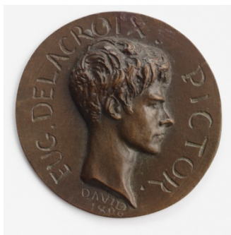
David d'Angers, Eugène Delacroix , 1828, bronze, private collection

Today David’s portrait medallions are the best known and most readily collected of his works. Over a period of roughly forty years, the sculptor produced a portable pantheon of some five hundred contemporaries. This hoard of (mostly) illustrious men and women was mass-produced by Parisian foundries, pirated and hawked on the streets of many European cities, and coveted by consumers of celebrity. Hardly a new medium in the nineteenth century, medals drew much of their authority and prestige from a supposed connection to numismatic conventions dating back to antiquity. Essentially an invention of the Renaissance, they were widely considered the most reliable testaments of the past.