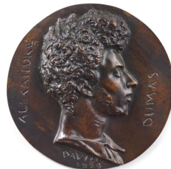
David d'Angers (1788–1856), Alexandre Dumas , 1829, bronze, private collection

With notable exceptions, David's medallions present portraits in profile, a standard composition that stems from ancient coins. Like so many other artists in the late eighteenth and early nineteenth centuries, David valued the profile view for its ability to quickly and accurately describe an individual. As he explained, "I have always been moved by the sight of a profile. The profile is in relation to other beings; it will shun you, it doesn't see you. The [full] face shows you more traits, and is more difficult to analyze. The profile is unity." Although profile views typically evoke stillness and linearity, the high relief and expressive surfaces of David's medallions produce complex and constantly shifting light effects—the bronze discs seem to tremble within one's grasp. This effect is only heightened in examples such as the Alfred de Musset , where the figure is caught in a three-quarter view, emerging fluidly from its concave background.