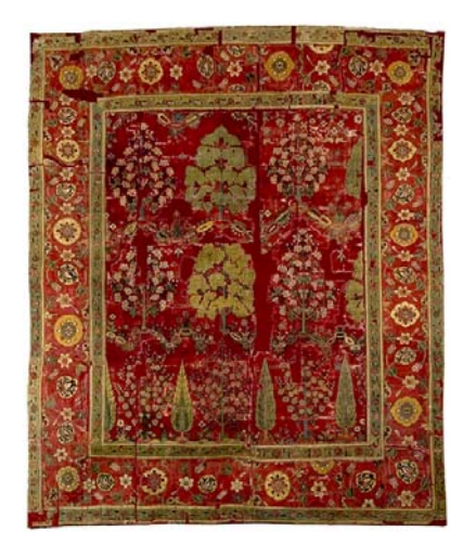
Northern India, reign of Shah Jahan, c. 1650, Carpet with Tree Pattern, The Frick Collection, New York

This spring and summer, visitors to The Frick Collection will have an opportunity to see two of the finest surviving examples of the carpet weaver's art. These recently conserved Mughal carpets, one of which has never before been