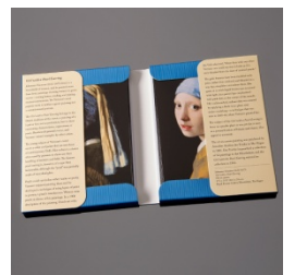
Notecard Wallet $9.99