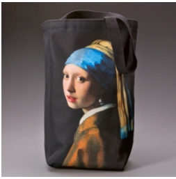
Tote Bag $30