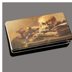
Pencil Tin $16.95