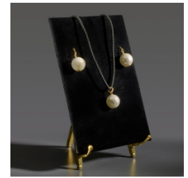
Earrings $49.95/ Necklace $88