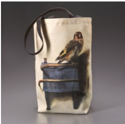
Tote Bag $30