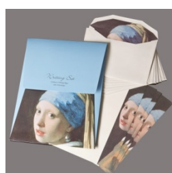
Note Cards $12.95