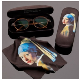
Eyeglass Case $20