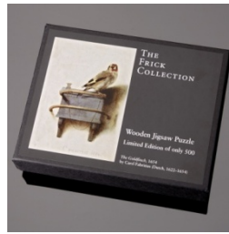
Puzzle (500 Piece) $50