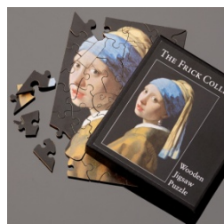
Puzzle (40 Piece) $12