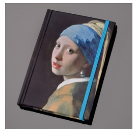
Address Book $14