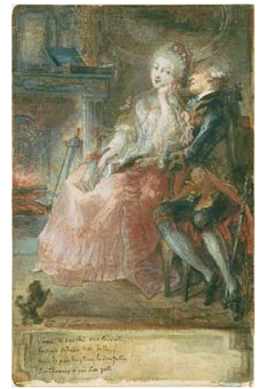
"L'Entretien gallant," 1760, watercolor and gouache, 20 x 13 cm, Museum of Fine Arts, Boston, Forsyth Wickes Collection