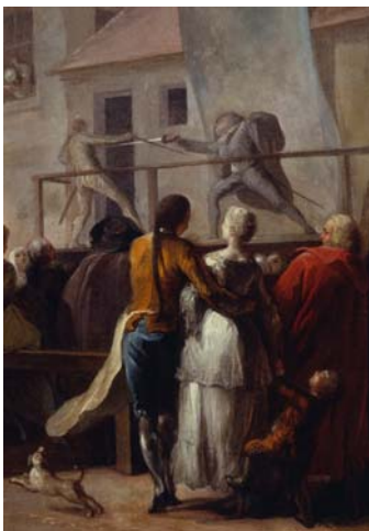
A Street Show in Paris (detail), 1760, oil on canvas, 81 x 63 cm, The National Gallery, London, Bought Lewis Fund, 1907

varied oeuvre in the media of painting, drawing, and etching. The selection of drawings in particular, will reveal the artist's achievement in a variety of thematic areas as well as highlight Saint-Aubin's extraordinary response to virtually every aspect of life and thought in eighteenth-century Paris—itself a microcosm of the life and thought in Europe during the Enlightenment. The exhibition will provide visitors with the opportunity to glimpse Paris as it was two hundred and fifty years ago, through appealing depictions of the city's architecture, theater, the Salon, domestic life, and popular entertainment, each a subject that Saint-Aubin rendered in an immediate, impressionistic style that anticipates that of artists of the late nineteenth century. Major funding for Gabriel de Saint-Aubin (1724–1780) has been provided by The Florence Gould Foundation. Additional generous support has been provided by