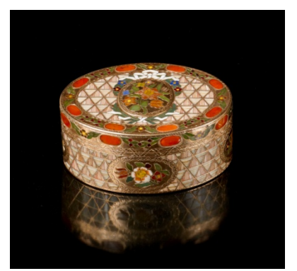
Johann Christian Neuber, box decorated with a geometric pattern and a bouquet of flowers, gold and semiprecious stones, marked: « NEU/BER » and « DRE/SDE », Dresden, c. 1775–80, L: 3 1/2 inches, H: 1 1/4 inches, private collection; photo: © Éditions Monelle Hayot /photo Thomas Hennocque

During the 1770s and 1780s, Neuber's naturalistic designs evolved into a more classical style, as illustrated by the box at left, which is decorated with a diamond pattern. A bouquet of flowers composed of a variety of hard stones appears against a background of burnished gold. By pushing a concealed button,