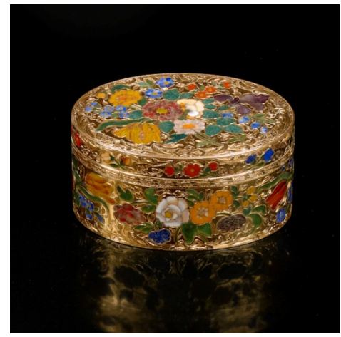
Johann Christian Neuber (1736–1808), box inlaid with semiprecious stones, Dresden, 1765–70, L : 2\frac{1}{2} inches, H : 1\frac{1}{2} inches, private collection

individual leaves made of green jasper. An antique ruin and a village with a castle on top of a hill can be seen in the distance, while the decorations on the box's sides include a shepherdess tending her sheep. Such virtuosity is extremely rare, even for a master such as Neuber. More characteristic, but equally exquisite, are Neuber's boxes decorated with colorful flowers. In the example at right, Neuber used yellow, orange, and red jasper for the tulips; lapis lazuli for the forget-me-nots; amethyst for the irises; white agate for the gardenias; carnelian for the primroses; and various shades of green jasper for the leaves. This mosaic is inlaid into a background of burnished gold, which gives the box a particularly luxurious appearance.