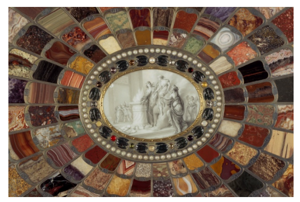
Johann Christian Neuber (1736–1808), Breteuil Table (detail of top), 1779–80, wood, gilded bronze, semiprecious stones, faux-pearls, and Meissen porcelain plaques, W: 28 inches, D: 25 ½ inches, H: 32 inches, Collection of the Marquis de Breteuil, Château de Breteuil

In addition to the steinkabinetts , the exhibition features Neuber's masterpiece, the Breteuil Table , shown below in detail and in full on page 1. This small table is regarded as one of the most extraordinary pieces of eighteenth-century furniture ever made, distinguished not only by the materials used in its construction and for the remarkable skill of its creator, but also for its prestigious history. It was presented in 1781 by Friedrich Augustus III to Baron de Breteuil, a French diplomat, as recognition for the role he played in the negotiation of the Treaty of Teschen. This agreement officially ended the war of Bavarian Succession fought between the Habsburg monarchy and a Saxon-Prussian alliance to prevent the Habsburg acquisition of the Duchy of Bavaria. The table has a mosaic top