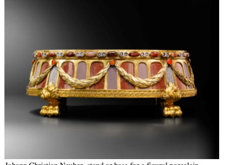
Johann Christian Neuber, stand or base for a figural porcelain group from the Meissen Porcelain Manufactory, Dresden, 1780, gilded bronze, agate, carnelian, glass, and marble, L: 16 inches, D: 13 1/3 inches, H: 5 3/4 inches, private collection; photo: ⊚ Hugues Dubois

varying heights, each supporting an allegorical group made of Meissen porcelain. Of the seven bases, only these