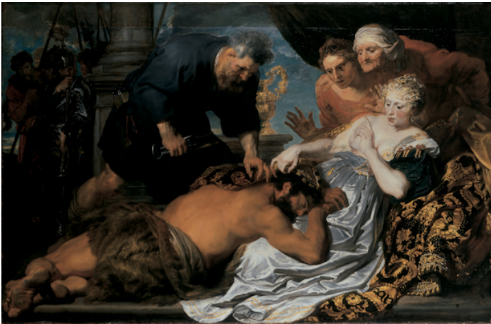
Sir Anthony Van Dyck (1599–1641), Samson and Delilah, c. 1618–20, oil on canvas, 151.4 x 230.5 cm, Bourgeois Bequest, 1811.