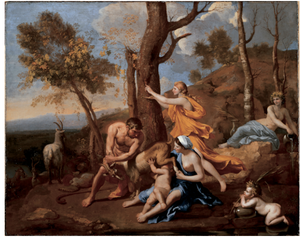
Nicolas Poussin (1594–1665), The Nurture of Jupiter, c. 1636–37, oil on canvas, 96.2 x 119.6 cm, Bourgeois Bequest, 1811

learned in Rome, the city where he spent most of his life. Orchestrated like an ancient relief, the painting is a supreme example of Poussin's skill as a colorist. Poussin was one of Desenfans's and Bourgeois's favorite artists, and they decorated the dining room of their London house solely with paintings by (or attributed to) him. The Nurture of Jupiter depicts an event from Greek mythology, recounted by ancient authors, including Ovid and Virgil. Jupiter was the son of Saturn and Rhea. Saturn had been told in a prophecy that one of his sons would overthrow him and rule the world; he therefore swallowed all five of the children he had