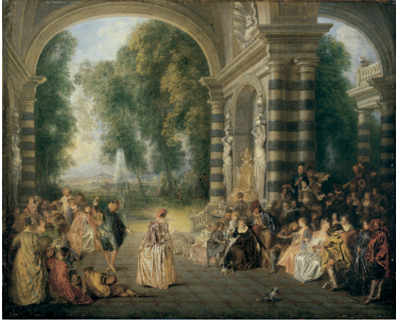
Jean-Antoine Watteau (1684–1721), Les Plaisirs du bal (Pleasures of the Dance) , c. 1717, oil on canvas, 52.6 x 65.4 cm, Bourgeois Bequest, 1811, © The Trustees of Dulwich Picture Gallery