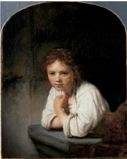
Rembrandt van Rijn (1606–1669), A Girl at a Window ,

1645, oil on canvas, 81.6 x 66 cm, Bourgeois Bequest, 1811, Window , 1645; Peter Lely's Nymphs by a Fountain , c.