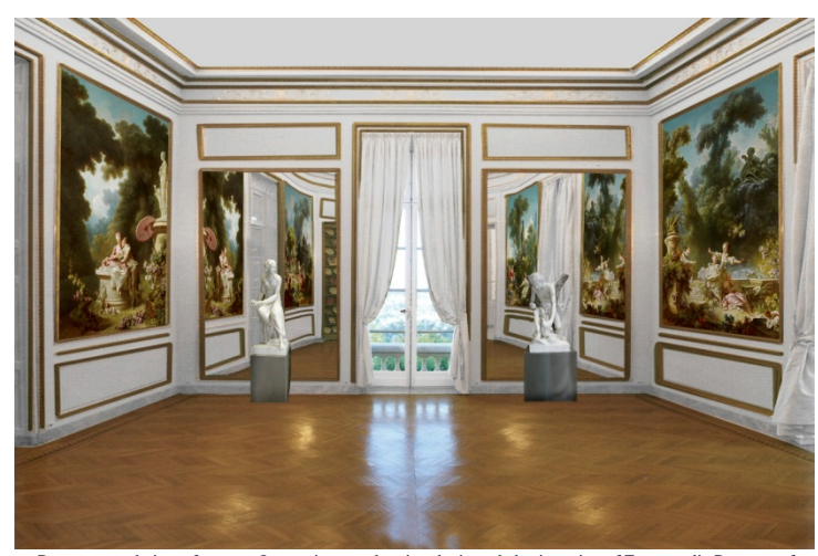
Reconstructed view of room at Louveciennes, showing the intended orientation of Fragonard's Progress of Love as commissioned for the comtesse du Barry