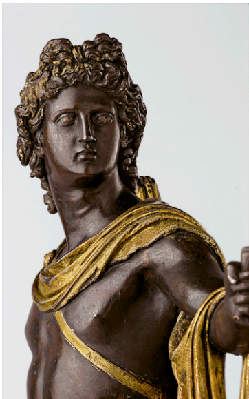
Pier Jacopo Alari Bonacolsi, called Antico (c. 1455–1528), Apollo Belvedere (detail), c. 1490, bronze with gilding and silvering, 16 ¼ inches, Liebieghaus Skulpturensammlung, Frankfurt am Main

Pier Jacopo Alari Bonacolsi, known as Antico (c. 1455–1528) was a transformative sculptor who brought the classical world to life. His contributions are celebrated in Antico: The Golden Age of Renaissance Bronzes , the first monographic exhibition in the United States devoted to the Italian sculptor and goldsmith. The acclaimed exhibition opens at The Frick Collection May 1, 2012, after its successful run this past winter at the National Gallery of Art, Washington. It will present forty-six objects, thirty-seven by Antico, comprising almost three-quarters of the master's rare surviving oeuvre. They span Antico's activity and represent the genres in which he worked: medals, statuettes, life-size busts, and reliefs. Antico: The Golden Age of Renaissance Bronzes was organized by the National Gallery of Art, Washington, in association with The Frick Collection, New York. The exhibition is organized by Eleonora Luciano, associate curator of sculpture, National Gallery of Art, in collaboration with Denise Allen, curator, The Frick Collection, New York, and Claudia Kryza-Gersch, Curator of the