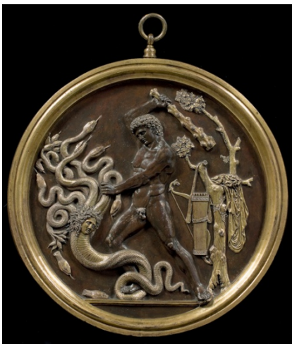
Pier Jacopo Alari Bonacolsi, called Antico (c. 1455–1528), Hercules and the Lernaean Hydra, c. 1496, bronze with gilding, 12 7/8 inches, Museo Nazionale del Bargello, Florence

Belvedere —they vigorously acquired small-scale antiquities, among them as cameos, engraved gems, and bronze statuettes. Antico’s first patron, Gianfrancesco Gonzaga di Ròdigo, was a renowned collector of Roman coins. His death inventory of 1496 records an astonishing group of 2,095 in gold, silver, and bronze. Ancient coins inspired the Renaissance art form of the portrait medal, and of all fifteenth-century examples, Antico’s most resemble Roman coins in format and symbolic language. His medal of Gianfrancesco (previous page) is exactly the same size as an imperial sestertius, and he shows the lord draped like an emperor. On the reverse, the gods Mars and Minerva flank a personification of Fortune, and all three stand on a flat platform, called an exergue , which is typically found on Roman coins. Yet other elements, like Gianfrancesco’s hairstyle, are contemporary, and the figures on the reverse are larger and more voluptuously rendered than their classical prototypes. Antico’s command of numismatic conventions endows the medal with ancient authenticity, convincingly transformed into a modern idiom. By including his signature (ANTI) beneath the exergue , Antico provokes the comparison between past and