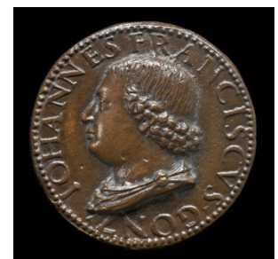
Pier Jacopo Alari Bonacolsi, called Antico (c. 1455–1528), Gianfrancesco Gonzaga di Ròdigo, c. 1486–1490, bronze, 1 5/8 inches, National Gallery of Art, Washington, Widener Collection

Little is known about Antico’s training, but an early inventory lists silver vases “signed by the hand of Antico,” suggesting that he probably began his career as a goldsmith. He spent his life working as sculptor to the Gonzaga family, who ruled Mantua, a small independent principality in northern Italy. The Gonzaga promoted a culture of splendid display that brought the glories of classical Rome to their courts. Although they did not have access to singular, large-scale ancient marbles—such as the Apollo