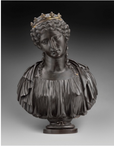
Pier Jacopo Alari Bonacolsi, called Antico (c. 1455–1528), Cleopatra , c. 1525, bronze with traces of gilding, 25 3/8 inches, Museum of Fine Arts, Boston, William Francis Warden Fund; photo: © 2012 Museum of Fine Arts, Boston

Antico's last Gonzaga patron, Isabella d'Este, Marchioness of Mantua, was the greatest female collector of the Renaissance. She indulged her admitted "insatiable appetite for antiquities" for more than thirty years and developed a famed collection that was identified with her taste, sophistication, and character as a ruler. Antico and Isabella formed a close, enduring relationship. Although she tended to manage every detail of a commission, often to artists' dismay, in 1503 she entrusted Antico to choose the subject of a female statuette intended for the cornice over the doorway of the room where she displayed her greatest works.