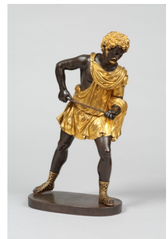
Pier Jacopo Alari Bonacolsi, called Antico (c. 1455–1528), Meleager, probably by 1496, bronze with gilding and silvering, 12 1/8 inches, Victoria and Albert Museum, London. Purchased from the Horn and Buyan bequests with the assistance of a contribution from The Art Fund

To Antico and his patrons, ancient sculpture represented the model of artistic perfection. Antico’s older contemporary, the painter Andrea Mantegna, set the example at the Gonzaga courts. In the Lives of the Artists of 1550, Giorgio Vasari wrote of Mantegna, “Andrea always believed that good classical statues were more perfect and possessed more beautiful parts than those that are shown by nature.” Because ancient marble sculptures known to the Renaissance were often fragmentary relics, imaginative reconstruction was required before their beauty might outshine nature’s own. Mantegna brought an entire classical world to life in his encyclopedic paintings. As a sculptor, Antico concentrated on reconstructing individual classical works, both in fact and in his own art. During the 1490s (and probably earlier), Antico spent time in Rome working as a restorer of ancient marbles. He recorded this activity by inscribing the monumental statues of the Horse Tamers on the