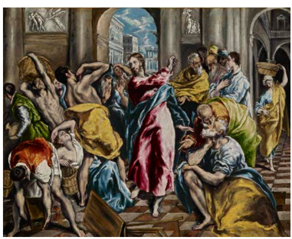
El Greco (1541–1614), Purification of the Temple , c. 1600, oil on canvas, The Frick Collection

November 4, 2014, through February 1, 2015