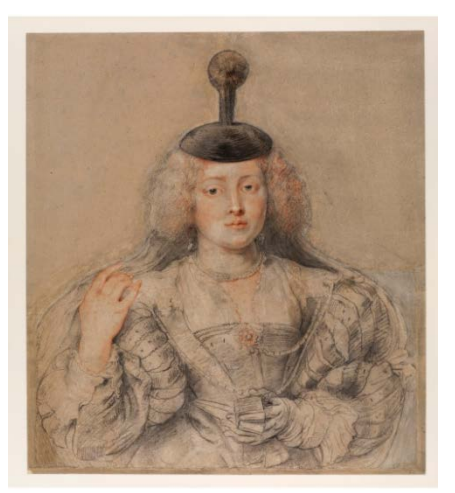
Peter Paul Rubens (1577–1640), Helena Fourment, c. 1630, black, red, and white chalk and pen and ink, 24 \times 21 \frac{1}{2} inches; The Courtauld Gallery (Samuel Courtauld Trust)

In keeping with its tradition of exhibiting masterworks from collections outside of New York, the Frick will present fifty-eight drawings this fall from The Courtauld Gallery, London. This exhibition marks the first time that so many of the principal drawings from The Courtauld's renowned collection—one of Britain's most important—have been made available for loan. The prized sheets represent a survey of the extraordinary draftsmanship of Italian, Dutch, Flemish, German, Spanish, British, and French artists active during the late Middle Ages through the early twentieth century. The exhibition features works executed in a range of drawing techniques and styles and for a variety of purposes, including preliminary sketches, practice studies, aide-mémoires , designs for other artworks, and