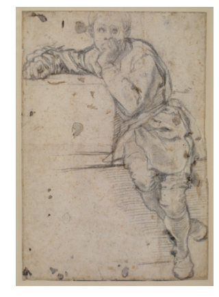
Jacopo Pontormo (1494–1557), Seated Youth (recto), c. 1520, chalk (black) on paper, 15.9 x 11 inches

A drawing by a Florentine artist of the next generation bears the marks not only of its maker, but of the members of his workshop in whose hands it may have circulated; the sheet is heavily stained with splashes of gray-black ink. Pontormo 's riveting study Seated Youth most likely shows one of his apprentices, or garzoni , posed on stone steps, resting his right arm and shoulder on a block, and bringing his left hand to his mouth in a gesture of some anxiety. The boy's eyes are wide open, and both his facial expression and body language seem to register fear. This drawing from life was done quickly and confidently, with Pontormo revising only the placement of the boy's right arm.