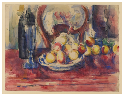
Paul Cézanne (1839–1906), Apples, Bottle and Chairback, c. 1904–1906, graphite and watercolor on wove paper, 18 x 23.8 inches

The grandest of the works on paper bequeathed by Courtauld to the Gallery is Paul Cézanne 's Apples, Bottle and Chairback , a watercolor made in the last years of the artist's life. Here Cézanne literally floods the paper with color and light, achieving a freshness and radiance that equal, if not surpass, his late paintings in oil. This festive still life consists of a blue and white faïence dish, placed at the center of the table and filled with apples. Five apples have tumbled from the dish and now sit apart on the table; a sixth seems to be in the process of joining them. At left, a bottle with its neck truncated glows almost black; in front of it