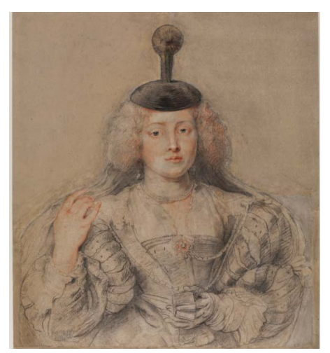
Peter Paul Rubens (1577–1640), Helena Fourment , c. 1630, black, red, and white chalk and pen and ink, 24 x 21 ½ inches; © The Samuel Courtauld Trust, The Courtauld Gallery, London

October 2, 2012, through January 27, 2013