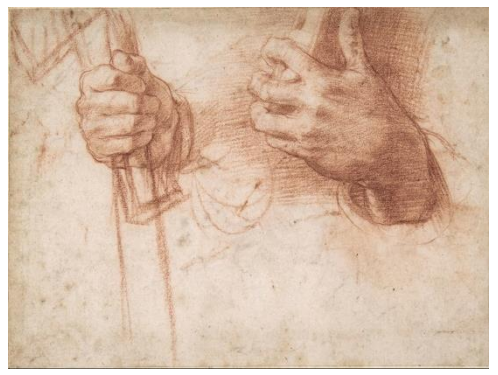
Studies of Hands, ca. 1527, red chalk, The Metropolitan Museum of Art, New York

Like the figures in the Composition Study for the Birth of Saint John the Baptist , this figure (which becomes an apostle in the altarpiece) is drawn unclothed despite its being a study for a heavily draped figure. Careful articulation of musculature reveals Andrea's power of observation and suggests that he sought to understand the anatomical mechanics of a pose even if the final figure was to be clothed. At the same time, he is selective in his focus: here, he concentrates on the back, buttocks, and right arm and leg, leaving the left hand, feet, and face unarticulated. By capturing live models in this way, he activates his paintings, infusing his sacred and secular dramas with a deeply human character.