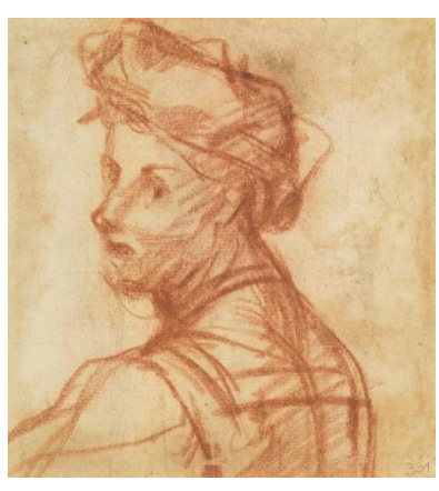
Study of a Young Man (verso), ca. 1517–18, red chalk, Galleria degli Uffizi, Gabinetto Disegni e Stampe, Florence; by permission of the Ministero dei beni e delle attività culturali e del turismo

A suite of drawings that explore a figure looking over his shoulder prepares Andrea's most famous portrait, the Portrait of a Young Man from the National Gallery in London (illustrated on page 1). Long believed to be a self-portrait, it has evaded definite identification. The sitter holds what appears to be an open book, a common attribute that may refer to his intellect, humanist interests, or profession. In the Study of a Young Man —one of two related drawings in the exhibition—a small but forceful impression of red chalk representing the sitter's left eye conveys the intensity of his gaze. Energetic strokes of chalk establish his confidence as he turns to confront the viewer's eye. The kinetic pose echoes Andrea's swift handling of chalk. In the painting, the sitter's garments are a tour de force of