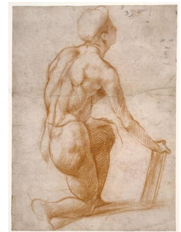
Study of a Kneeling Figure, 1522–26, red and black chalks, The J. Paul Getty Museum, Los Angeles

The Birth of the Baptist compositional study was certainly accompanied by now-lost drawings studying individual figures, similar to that of the Study of a Kneeling Figure , which was produced in preparation for the altarpiece known as the Panciatichi Assumption (Palazzo Pitti, Florence). This vibrant sheet offers a view inside Andrea's workshop, in which his studio assistants, called garzoni , often served as ready models.