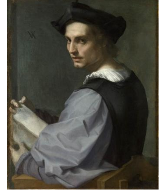
Portrait of a Young Man, ca. 1517–18, oil on canvas, National Gallery, London

Museum, Los Angeles, where it has run as a summer show. In New York, the presentation will feature forty-five drawings and three paintings from international collections and will offer an unprecedented look inside the creative production of one of the most influential figures in Italian Renaissance art. To be shown in the Oval Room and in the lower-level galleries, the exhibition was coordinated at the Frick by Associate Curator Aimee Ng and is accompanied by a substantial catalogue as well as a series of public programs. Principal