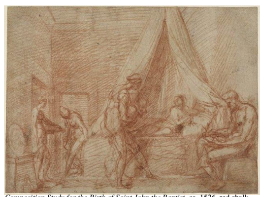
Composition Study for the Birth of Saint John the Baptist, ca. 1526, red chalk. British Museum, London

In comparison to figural studies, relatively few of Andrea's compositional sheets survive. These drawings, which map the placement of figures in space, document him thinking through the challenges of pictorial storytelling. The Composition Study for the Birth of Saint John the Baptist prepares a fresco in Florence's Chiostro dello Scalzo, which takes its name from the ritualistic barefoot ("scalzo") processions of the resident brotherhood of St. John the Baptist. Considered one of the major narrative fresco cycles of the Renaissance in Florence, the decorative program and twelve scenes for