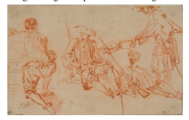
Watteau, Three Studies of a Soldier and a Kneeling Man , ca. 1710–11, red chalk, with brown ink framing, École nationale supérieure des Beaux-Arts, Paris

them on the canvas. For instance, the two men on the left in the drawing seem to be staring at each other, engaging in some kind of silent dialogue. In the painting, however, the crouching soldier is now shown looking up at the officer in red (left), leaving the other soldier (in the middle of the composition, in front of the tree) staring into space. Watteau's process preserves the sense of opacity we observe in his studies. The drawings served as building blocks for a whole architecture of irresolution and ambiguity.