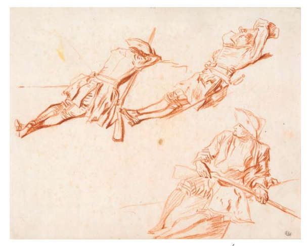
Watteau, Three Studies of Resting Soldiers, ca. 1713–14, red chalk, École nationale supérieure des Beaux-Arts, Paris