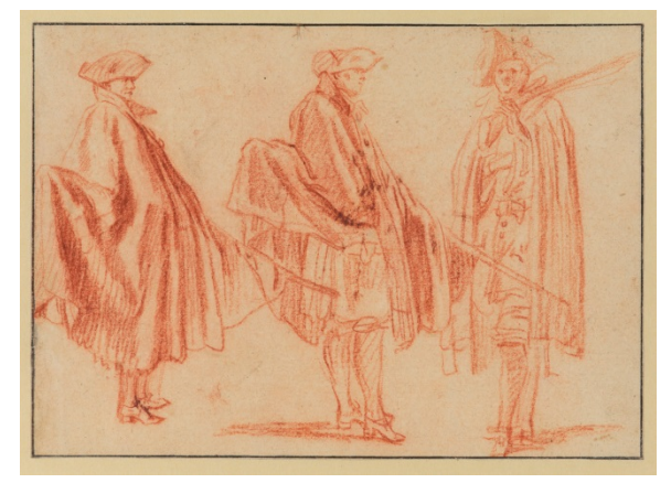
Watteau, Three Studies of Soldiers Holding Muskets and Wearing Capes, ca. 1710, red chalk and stump on cream paper, The Courtauld Institute Galleries, London

The Frick's Portal of Valenciennes (front page) and a related drawing, Three Studies of Soldiers Holding Muskets and Wearing Capes (right)—shown together for the first time in this exhibition—are a case in point. In composing the painting, Watteau used the central figure in the drawing as the basis for the soldier on the far left of the canvas. In this new context, the man now faces another soldier, but the remnants of his previous isolation on the page persist. Because the figures were not originally drawn or conceived as engaging with each other, their gazes do not quite meet. What appears on first inspection to be a