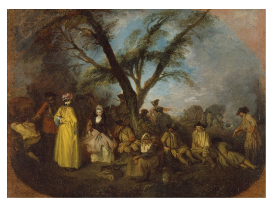
Watteau, The Halt, ca. 1710, oil on canvas, Museo Thyssen-Bornemisza, Madrid

scene of conviviality (if not quite esprit de corps ) gives way to a series of failed connections, a vision of uneasy and troubled social commerce.