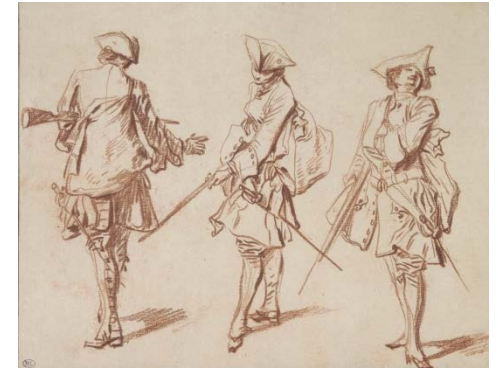
Watteau, Three Views of a Soldier, One from Behind, ca. 1713–15, red chalk, with black ink framing, Musée du Louvre, Paris; photo: © RMN-Grand Palais/Art Resource, NY

life—marches, halts, and encampments. The resulting works show quiet moments between the fighting, outside the regimented discipline of drills and battle, when soldiers could rest and daydream, smoke pipes and play cards. Although these themes are indebted to seventeenth-century Dutch and Flemish genre scenes, Watteau's drawings and paintings are set apart by their focus on the common soldier. More than his predecessors, Watteau offers an intimate vision of war, one in which the human element comes to the fore. His soldiers are endowed with an inner life, with subjectivity.