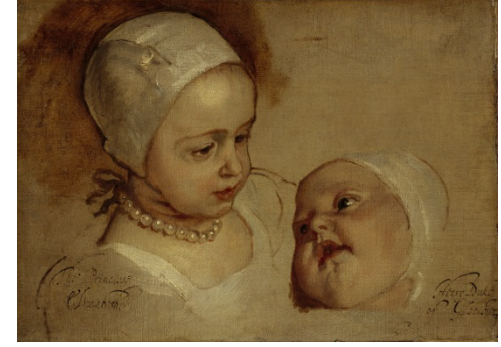
Van Dyck, The Princesses Elizabeth and Anne, Daughters of Charles I , 1637, oil on canvas, Scottish National Portrait Gallery, Edinburgh; purchased with the aid of the Heritage Lottery Fund, the Scottish Office, and the Art Fund 1996

United States in more than twenty years. Through approximately one hundred works, the show explores the versatility and inventiveness of a portrait specialist, the stylistic development of a draftsman and painter, and the efficiency and genius of an artist in action. Organized chronologically around the different geographic chapters of Van Dyck's career, the exhibition documents the artist's development from an