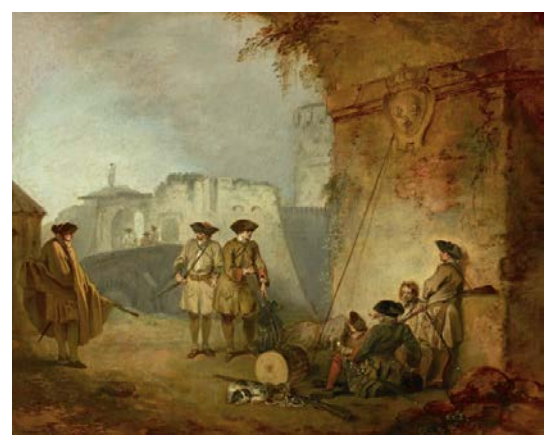
Jean-Antoine Watteau (1684–1721), The Portal of Valenciennes , ca. 1710–11, oil on canvas, The Frick Collection

Best known as a painter of amorous aristocrats and melancholy actors, Jean-Antoine Watteau also painted a number of military scenes, most executed during the War of the Spanish Succession (1701–14). Rather than the turmoil of battle, Watteau focused on the prosaic aspects of military life—marches, halts, and encampments. The resulting works show quiet moments between the fighting, outside the regimented discipline of drills and battle, when soldiers could rest and daydream, smoke pipes and play cards.