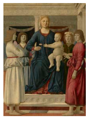
Piero della Francesca (c. 1411/13–1492), Virgin and Child Enthroned with Four Angels, c. 1460–70s, oil (and tempera?) on wood, 42.4 x 30.9 inches

Revered in his own time as a 'monarch' of painting, Piero della Francesca (1411/13–1492) is acknowledged today as a founding figure of the Italian Renaissance. In early 2013, The Frick Collection presents the first monographic exhibition in the United States dedicated to the artist. It brings together seven works by Piero della Francesca, including six panels from the Saint' Agostino altarpiece—the largest number from this masterwork ever reassembled. They are joined by the Virgin and Child Enthroned with Four Angels , his only intact altarpiece in this country. Piero della Francesca in America is organized by Nathaniel Silver, Guest Curator and former Andrew W. Mellon Curatorial Fellow. The related catalogue includes essays by James Banker, Professor Emeritus, North Carolina State University; Machtelt Israëls, Guest Researcher, University of Amsterdam; Elena Squillantini, masters candidate, Università degli Studi di Firenze; and Giacomo Guazzini, doctoral candidate, Scuola Normale Superiore di Pisa. Exclusive to the Frick, where it is shown in the Oval Room, this important exhibition is also accompanied by a rich and varied schedule of lectures, gallery talks, and seminars.