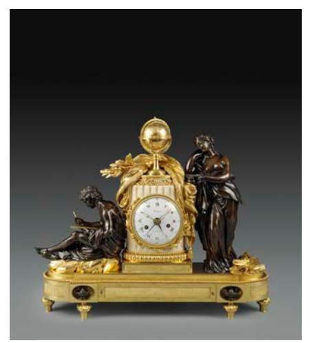
Mantel Clock with Study and Philosophy, movement by Renacle-Nicolas Sotiau (1749–1791), figures after Simon-Louis Boizot (1743–1809), c. 1785–90, patinated and gilt bronze, marble, enameled metal, and glass, H.: 22 inches, private collection

Today the question "What time is it?" is quickly answered by looking at any number of devices around us, from watches to phones to computers. For millennia, however, determining the correct time was not so simple. In fact, it was not until the late thirteenth century that the first mechanical clocks were made, slowly replacing sundials and water clocks. It would take several hundred years before mechanical timekeepers became reliable and accurate. Precision and Splendor: Clocks and Watches at The Frick Collection explores the discoveries and innovations made in the field of horology from the early sixteenth to the nineteenth century. The exhibition, on view in the new Portico Gallery, features thirty objects: five clocks lent by a private collector that have never before been seen in New York City, as well as eleven clocks and fourteen watches connected to the Winthrop Kellogg Edey bequest to the Frick. Viewable in the round at the end of the Portico Gallery is an undisputed masterpiece both of sculpture and clockmaking, The Dance of Time: Three Nymphs Supporting a Clock. It features a timepiece by the firm of clockmakers working for Kings Louis XV and XVI as well as a remarkable sculpture by Claude Michel, called Clodion (1738-1814). Together, these objects chronicle the evolution over the centuries of more accurate and complex timekeepers and