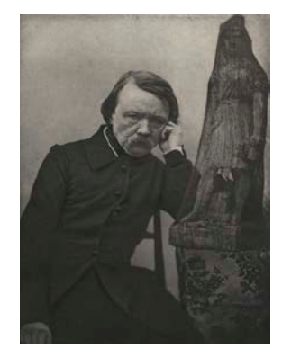
Anonymous, Portrait of Pierre-Jean David d'Angers, c 1845, photogravure after a daguerreotype, The Frick Art Reference Library, New York

September 17, 2013, through December 8, 2013