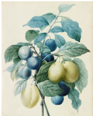
Pierre-Joseph Redouté (1759–1840), Plum Branches Intertwined , 1802–4, watercolor on vellum, 12 ½ x 10 1/3 inches, The Frick Collection, bequest of Charles Ryskamp

February 14, 2012, through April 8, 2012