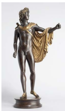
Pier Jacopo Alari Bonacolsi, called Antico (c. 1460–1528), Apollo Belvedere , c. 1490, copper with partial fire gilding and silvering; base of bronze, 16 ¼ inches without base, Liebieghaus Skulpturensammlung, Frankfurt

Antico: The Golden Age of Renaissance Bronzes is the first monographic exhibition in the United States dedicated to Jacopo Alari Bonacolsi, known as Antico (c. 1455–1528). As sculptor to the Gonzaga courts at Mantua and in northern Italy, Antico earned his name, “the antique one,” for his creation in the classical style of statuettes, reliefs, and busts that are distinguished by their opulence and beauty. Using inventive and highly refined techniques, Antico lavishly gilded, silvered, and patinated his works, elevating his bronze sculptures to the status of the ancient precious objects that were avidly collected by his Gonzaga patrons. Splendid and timeless, Antico's works represent a sophisticated court style and have always been exclusive and rare. Today fewer than fifty of his bronzes are known. Dispersed among museums in Europe and America, almost thirty-five of them will come together in this unprecedented presentation.