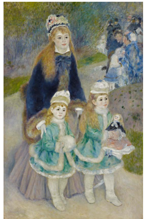
Pierre-Auguste Renoir (1841–1919), La Promenade , c. 1875–76, oil on canvas, 67 x 42 3/4 inches, The Frick Collection, New York, Photo: Michael Bodycomb

MANTEGNA TO MATISSE: MASTER DRAWINGS FROM THE COURTAULD GALLERY October 2, 2012, through January 27, 2013