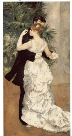
Pierre-Auguste Renoir (1841–1919), Dance in the City (La Danse à la ville) , 1883, oil on canvas, 71 x 35 ½ inches, Musée d'Orsay, Paris (Galerie du Jeu de Paume)

since 1886); and Dance in the City and Dance in the Country (1883) from the Musée d'Orsay, Paris. Works on loan from American institutions are The Dancer (1874) from the National Gallery of Art, Washington, D.C.; Mme Henriot "en travesti" (The Page) , (1875–76) from the Columbus Museum of Art; Acrobats at the Cirque Fernando (Francisca and Angelina Wartenberg) (1879) from the Art Institute of Chicago; and Dance at Bougival (1883) from the Museum of Fine Arts, Boston. The exhibition, which also includes the Frick canvas, will be shown in the Frick's East Gallery.