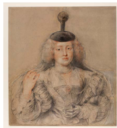
Peter Paul Rubens (1577–1640), Helena Fourment , c. 1630, black, red, and white chalk and pen and ink, 24 x 21 ½ inches; The Courtauld Gallery (Samuel Courtauld Trust)

In keeping with its tradition of exhibiting masterworks from collections outside of New York, the Frick will present fifty-eight drawings from The Courtauld Gallery, London. This exhibition marks the first time that so many of the principal drawings in The Courtauld's renowned collection—one of Britain's most important—have been made available for loan. The prized sheets represent a survey of the extraordinary draftsmanship of Italian, Dutch, Flemish, German, Spanish, British, and French artists active between the late Middle Ages and the early twentieth century. The survey features works executed in a range of drawing techniques and styles and for a variety of purposes, including preliminary sketches, practice studies, aide-mémoires , designs for other artworks, and finished pictures meant to be appreciated as independent works of art. Among the artists in the Frick's exhibition will be Andrea Mantegna, Leonardo da Vinci, Albrecht Dürer, Michelangelo Buonarroti, Peter Paul Rubens, Jusepe de Ribera, Rembrandt Harmensz van Rijn, Jean-Antoine Watteau, Charles-Joseph Natoire, Thomas Gainsborough, Francisco Goya y Lucientes, Joseph Mallord William Turner, Théodore Géricault, Edgar Degas, Paul Cézanne, Vincent van Gogh, Georges Seurat, Henri Matisse, and Pablo Picasso.