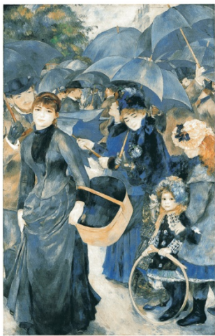
Pierre-Auguste Renoir (1841–1919), The Umbrellas , c. 1881 and 1885, oil on canvas, 71 x 45 inches, The National Gallery, London

In early 2012, The Frick Collection will present a dossier exhibition of nine iconic Impressionist paintings by Pierre-Auguste Renoir, offering the first comprehensive study of the artist's engagement with the full-length format, which was associated with the official Paris Salon in the decade that saw the emergence of a fully fledged Impressionist aesthetic. The project was inspired by La Promenade of 1875–76, the most significant Impressionist work in the Frick's permanent collection. The exhibition explores Renoir's portraits and subject pictures of this type from the mid-1870s to mid-1880s. Intended for public display, these vertical grand-scale canvases are among the artist's most daring and ambitious presentations of contemporary subjects and are today considered masterpieces of Impressionism. On view only at the Frick, Renoir, Impressionism, and Full-Length Painting is a landmark exhibition, bringing together several beloved masterworks from around the world. Paintings on loan from international institutions are Parisienne (1874) from the National Museum Wales, Cardiff; The Umbrellas , (c. 1881 and 1885) from The National Gallery, London (first time on view in the United States