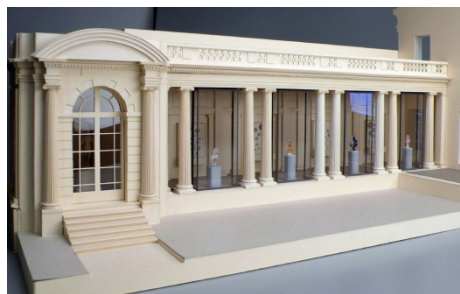
Model of the Portico Gallery for Decorative Arts and Sculpture, south façade, by Davis Brody Bond, architects and planners for the project

On December 13, visitors to The Frick Collection will be able to enjoy a new gallery—the first major addition to the museum's display spaces in nearly thirty-five years. The inspiration for this initiative, which involves the enclosure of the portico in the Fifth Avenue Garden, comes from the intention of museum founder Henry Clay Frick (1849–1919) to build an addition to his 1914 mansion for his growing Collection of sculpture. The project was postponed in 1917 following the United States entry into World War I, and Mr. Frick died before it could be resumed. In recent years, the institution has placed greater focus on sculpture through critically acclaimed exhibitions and several key acquisitions, while also evaluating the effectiveness of the display