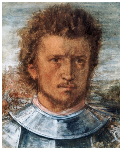
Edgar Degas (1834–1917), Head of a Soldier , 1857, watercolor, gouache, and red chalk wash over graphite, 25.6 x 21 cm, Fondation Custodia, Paris

knowledge of eighteenth- and nineteenth-century art and to the history of collecting, by focusing on one of the twentieth century's most renowned drawings collectors.