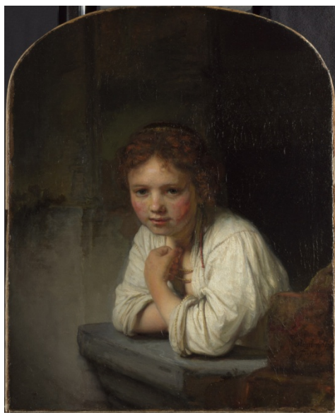
Rembrandt Harmensz van Rijn (1606–1669), Girl at a Window, 1645, oil on Canvas, 81.6 x 66 cm.

The Frick Collection is pleased to announce the loan of nine European paintings from Dulwich Picture Gallery in London, one of the major collections of Old Master pictures in the world, particularly of the seventeenth and eighteenth centuries. The exhibition, which heralds the Gallery's bicentenary in 2011, presents an exciting opportunity to introduce American audiences to this institution's collection through nine of its greatest paintings. Indeed, this exceptional group of works, to be shown exclusively at the Frick from March 9 through May 30, 2010, includes signature masterpieces that seldom travel, many of which have not been on view in the United States in recent years, and in some cases, never in New York City. Featured are Rembrandt van Rijn's (1606–1669) Girl at a Window , 1645; Sir Anthony Van Dyck's (1599–1641) Samson and Delilah , c. 1619–20; Thomas Gainsborough's (1727–1788) The Linley Sisters , probably 1772; Sir Peter Lely's (1618–1680) Nymphs by a Fountain , before 1640; Canaletto's (1697–1768) Old Walton Bridge over the Thames , 1754; Gerrit Dou's (1613–1675) A Woman Playing a Clavichord , c. 1665; Antoine Watteau's (1684–1721) Les Plaisirs du Bal , most likely 1715–17; Bartolomé Esteban Murillo's (1618–1682) The Flower Girl , 1665–70; and Nicolas Poussin's (1594–1665) The Nurture of Jupiter , mid-1630s.