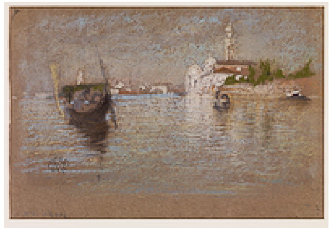
Whistler, The Cemetery: Venice, 1879, pastel, with some stumping, over traces of underdrawing in graphite on dark brown, The Frick Collection

Whistler worked as a portraitist throughout his career, securing commissions from members of the aristocratic and bohemian circles of London and Paris. His portrait of the actress Lady Meux (front page), whose scandalous marriage to a wealthy baronet made her notorious, captures all her sensual flair. Titled Harmony in Pink and Grey: Portrait of Lady Meux (1881–82), the painting is as much an exploration of color and texture as it is a perceptive likeness. Whistler’s mature portraiture is well represented at the Frick by four canvases from the last three decades of his life. He was also a master printmaker and traveled to Venice to complete a commission from the Fine Arts Society for twelve etchings, which came to be known as the First Venice Set . Whistler took a unique approach to the subject of Venice. Choosing to represent the city and its inhabitants in quiet moments glimpsed from narrow canals and second-story windows, he departed from the tradition of “vedute,” views of popular tourist spots such as San Marco and the Grand Canal. Frick purchased the full set of twelve, and they will be presented in the Cabinet, along with three plein-air pastels, which provide a colorful counterpoint to the etchings.