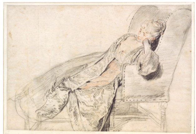
Jean-Antoine Watteau (1684–1721), Woman Lying on a Sofa , c. 1717–18, red, black, and white chalk, 21.7 x 31.1 cm, Fondation Custodia, Paris

An avid collector of works on paper from the age of fifteen, and an art historian whose scholarship continues to be cited today, Frits Lugt (1884–1970) played a formative role in the history of graphic arts. In 1947 Lugt established the Fondation Custodia, Paris, to care for and add to his collection of 6,000 Old Master drawings and 30,000 prints. Watteau to Degas: French Drawings from the Frits Lugt Collection features the collection’s most significant eighteenth- and nineteenth-century French works on paper. These drawings will be on view at The Frick Collection in the fall of 2009 and at the Fondation Custodia in the spring of 2010. Many of these drawings have never been exhibited in North America, and this will be the first time an exhibition of French works from the Fondation Custodia has been mounted in the United States. Furthermore, original research and the publication of several drawings for the first time will make the accompanying catalogue an important contribution to our