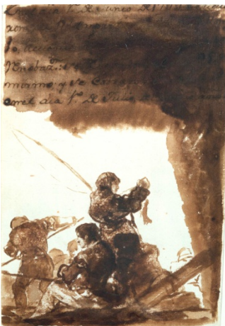
Francisco de Goya y Lucientes (1746–1828), The Anglers , 1799, brush and brown wash on paper, The Frick Collection

October 5, 2010, through January 9, 2011