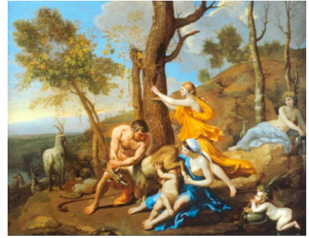
Nicolas Poussin (1594–1665), The Nurture of Jupiter, mid-1630s, oil on canvas, 96.2 x 119.6 cm.