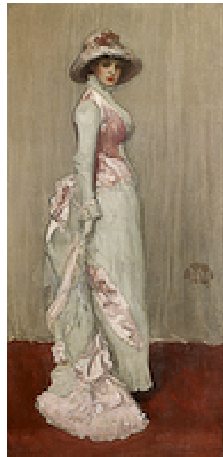
Whistler, Harmony in Pink and Grey: Portrait of Lady Meux , 1881–82, oil on canvas, The Frick Collection