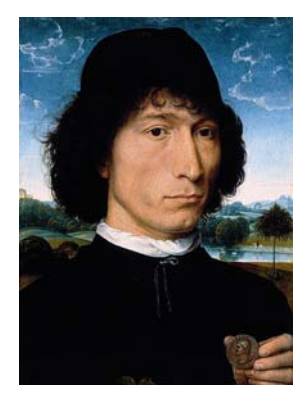
Hans Memling, Portrait of a Man with a Coin of the Emperor Nero (Bernardo Bembo)?, c. 1473-74?, Panel, 31 x 23.2 cm, Antwerp, Koninklijk Museum voor Schone Kunsen, inv. 5

patrons. Additional paintings unique to each venue's showing have also been chosen to illuminate topics of particular relevance to Memling's work: the exchange of influences with contemporary portraiture from Italy and Germany (Museo Thyssen-Bornemisza); issues of patronage relating to donor-portraits (Groeningemuseum); and the role of the workshop in artistic production (The Frick Collection). This concentrated study not only illuminates the career of a Renaissance master, but also explores the function of portraiture in the Netherlands during the fifteenth century. Memling's Portraits made its debut at the Museo Thyssen-Bornemisza, Madrid, on February 15, 2005 (through May 15), then travels to the Groeningemuseum, Bruges (June 7 through September 4, 2005), before its presentation at The Frick Collection in October 2005, the final venue of the tour.