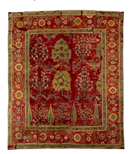
Northern India, reign of Shah Jahan, c. 1650, Carpet with Tree Pattern, silk and pashmina, The Frick Collection, New York

This spring and summer, visitors to The Frick Collection have an opportunity to see two of the finest surviving examples of the carpet weaver's art. These recently conserved Mughal carpets, one of which has never before been shown by the museum, are extremely rare and important fragments of larger works, and their exhibition has been