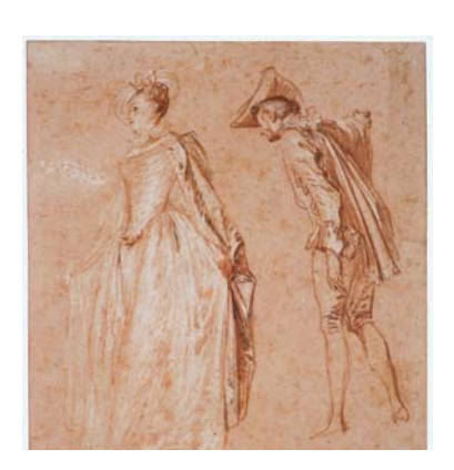
Antoine Watteau, Two Dancers, a Man and a Woman c. 1716/1717, red, black, and white chalks, 268 x 229 mm. Goethe-Nationalmuseum

An outstanding assemblage of objects, buildings, gardens, and collections was created with the 2003 union of two museums in Weimar, Germany, now known as Stiftung Weimarer Klassik und Kunstsammlungen. A touring exhibition presents a selection of approximately seventy drawings from this integrated institution and offers American audiences a unique viewing opportunity, as many of these works have never been seen outside the former Eastern bloc countries; it is also the first time that many of these masterworks have been published. Sheets by such artists as Jacques Callot, Charles Le Brun, Claude Lorrain, Jacques Bellange, Simon Vouet, Antoine Watteau, François Boucher, Charles Natoire, Jean-Baptiste Greuze, and Charles-Louis Clérisseau, among others, are included, promising to shed new light on the individual oeuvres of these artists as well as deepen our understanding of their practice as draftsmen within the context of other French masters.