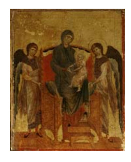
Cimabue (Cenni di Peppo) (c. 1240-c. 1302), The Virgin and Child Enthroned with Two Angels , c. 1280, tempera on panel, 27.5 x 20.5 cm, The National Gallery, London