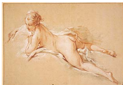
François Boucher (1703–1770) Recumbent Female Nude , c. 1742–43, Red, white, and black chalks on cream antique laid paper 12 1/2 x 18 1/4 in. Collection Jeffrey E. Horvitz, Boston

Celebrating the tercentenary of the artist's birth, this exhibition is the first survey of François Boucher's (1703–1770) drawings in over twenty-five years. Featuring approximately seventy-five sheets—few of which have ever been on view in the United States—the exhibition of international loans provides a new understanding of Boucher's