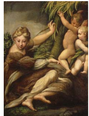
Parmigianino (1503–1540) Female Martyr , c. 1522–24 Oil on panel, 10 ¼ x 7 ½ in. Städtisches Kunstinstitut und Städtische Galerie, Frankfurt (1496)

Featuring approximately fifty-eight sheets, The Unfinished Print at The Frick Collection is a smaller version of an