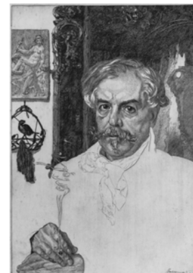
Félix Bracquemond (1833–1914) Edmond de Goncourt, 1882 Etching in black on japan paper Plate: 20 1/8 x 13 3/8 in.; Sheet: 21 9/16 x 14 1/8 in. National Gallery of Art, Washington, D.C., Gift of Mrs. Lessing J. Rosenwald 1987

exhibition that was organized by Peter Parshall, curator of Old Master prints at the National Gallery of Art, and on view at the National Gallery of Art, Washington, D.C., in 2001. This presentation investigates the question of aesthetic resolution in European printmaking from the fifteenth through the early twentieth centuries. The exhibition includes works in various stages of completion by such artists as Rembrandt, Piranesi, Degas, Gauguin, Villon, and Munch, all revealing the importance of artistic process in the history of printmaking. Coordinating the exhibition in New York is Susan Grace Galassi, Curator at The Frick Collection.