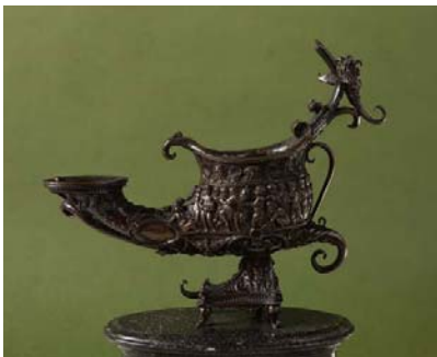
Riccio (Andrea Briosco), Oil Lamp, 1460/75(?)–1532 Bronze The Frick Collection, New York

For the first time in decades, The Frick Collection has undertaken a refurbishment of the Enamels Room display cases designed by John Russell Pope. The intimate wood-paneled Enamels Room, originally a private office for industrialist Henry Clay Frick (1849–1919), was transformed into a small cabinet gallery in his lifetime following the acquisition of a collection of rich Renaissance enamels, many formerly owned by J. P. Morgan. His enamels collection has been displayed in this room ever since, together with other Renaissance objects and paintings. Following a closure period of several months this spring, a fiber-optic lighting system was installed providing a new environment for the close viewing of precious, small-scale objects. A new installation was developed, and plans have been made to change the display annually, allowing the Collection to highlight its Renaissance holdings with greater flexibility. Fresh attention will be drawn to various objects in the