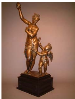
Venus and Cupid , late 16 th century Bronze alone: 30 x 15 3/4 in. Size of base: 6 1/4 x 11 1/4 x 9 7/8 in. Quentin Collection

September 28, 2004, through January 2, 2005