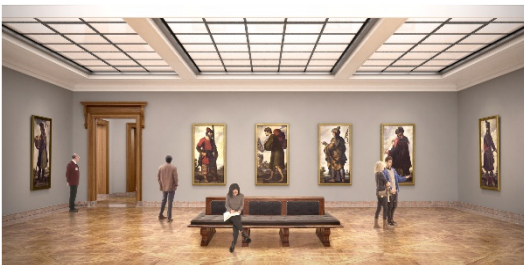
Special Exhibition Gallery; courtesy of Selldorf Architects