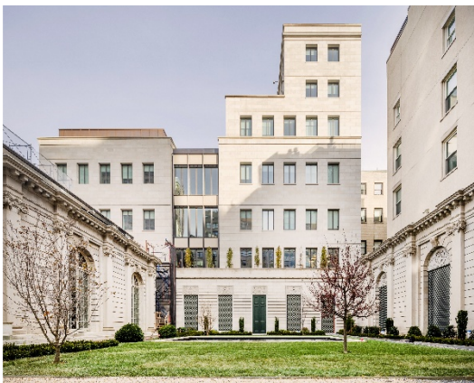
Photograph of the Frick buildings from East 70th Street, to the right of the mansion, taken during construction; photo: Ivane Katamashvili, courtesy of Selldorf Architects