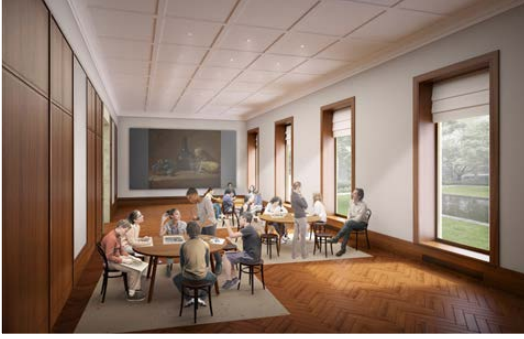
The Education Room; courtesy of Selldorf Architects