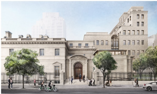
The Frick Collection from East 70th Street; courtesy of Selldorf Architects