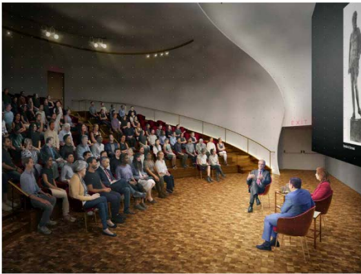
The auditorium; courtesy of Selldorf Architects