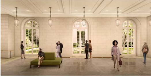
The Reception Hall overlooking the 70th Street Garden; courtesy of Selldorf Architects