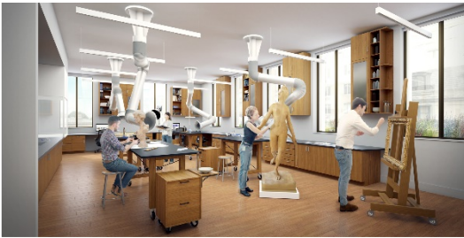
The museum's new objects conservation studio; courtesy of Selldorf Architects