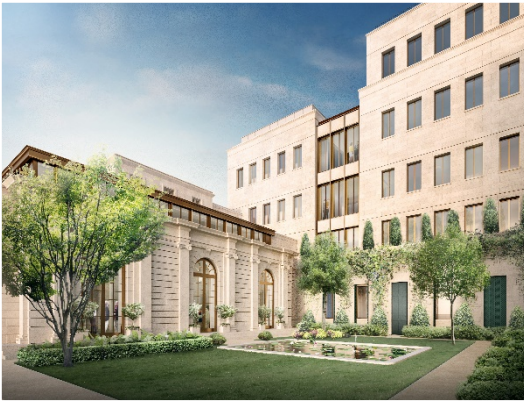
The Frick Collection from East 70th Street; courtesy of Selldorf Architects