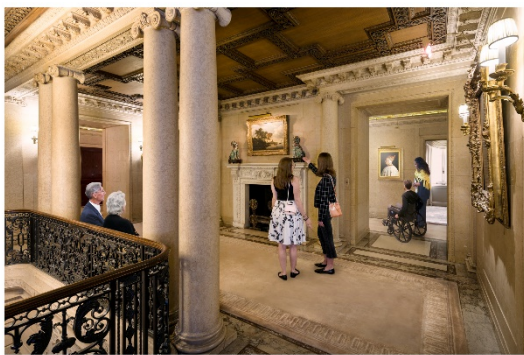
The second-floor landing, which leads to a series of new galleries for the display of small-scale objects from the permanent collection; courtesy of Selldorf Architects