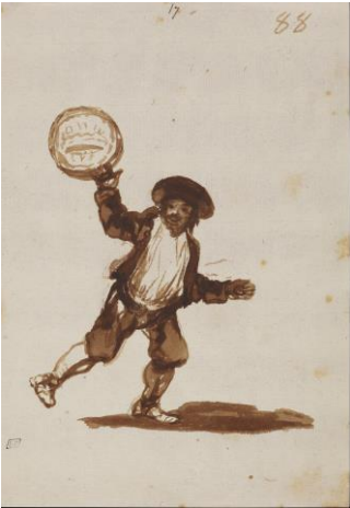
Francisco de Goya y Lucientes Tambourine Player , ca. 1812–20 Brush and brown wash on cream laid paper 8 1/16 x 5 5/8 inches Promised Gift from the Collection of Elizabeth and Jean-Marie Eveillard