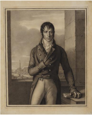
Jean-Baptiste Wicar Antoine-Christophe Saliceti , 1803 Black crayon with white chalk highlights and touches of graphite on cream wove paper 18 x 14 9/16 inches Promised Gift from the Collection of Elizabeth and Jean-Marie Eveillard