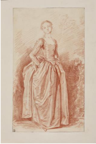
Jean-Honoré Fragonard Young Woman ("La Coquette") , ca. 1770–73 Red chalk with touches of black chalk underdrawing on cream laid paper 14 3/8 x 8 1/4 inches Promised Gift from the Collection of Elizabeth and Jean-Marie Eveillard