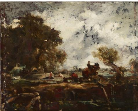
John Constable Study for "The Leaping Horse," ca. 1824–25 Oil on canvas 8 3/8 x 10 5/8 inches Promised Gift from the Collection of Elizabeth and Jean-Marie Eveillard