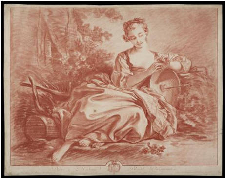
Gilles Demarteau, after François Boucher A Reclining Shepherdess ("La Bergère au Coeur") , ca. 1756–76

Red crayon manner engraving and printing ink on paper