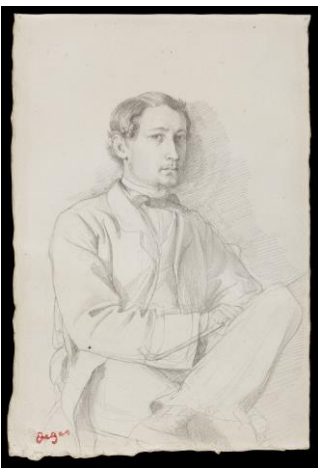
Edgar Degas Adelchi Morbilli, ca. 1857 Graphite on off-white wove paper 9 5/8 x 6 1/2 inches Promised Gift from the Collection of Elizabeth and Jean-Marie Eveillard