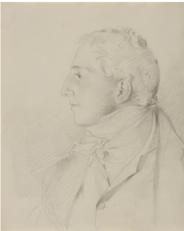
Thomas Lawrence John Angerstein, M.P. , ca. 1797

Graphite on off-white wove paper 9 3/4 x 7 7/8 inches