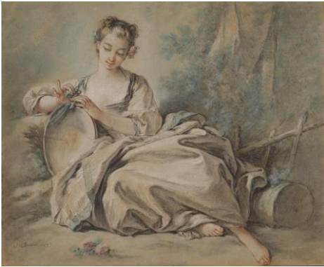
François Boucher A Reclining Shepherdess ("La Bergère au Coeur") , 1753

Black, red, and white chalk and blue, light blue, red, pink, and yellow pastel with touches of gray watercolor washes and possibly some traces of graphite on laid paper