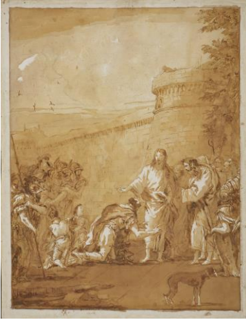
Giandomenico Tiepolo Christ and the Centurion of Capernaum , ca. 1786–90

Pen and brown ink, orange-brown wash, and black chalk over a black chalk underdrawing on off-white laid paper