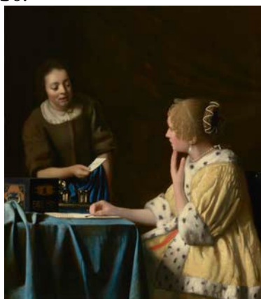
Johannes Vermeer (1632–1675) Mistress and Maid, ca. 1666–67 Oil on canvas 35 1/2 x 31 inches The Frick Collection, New York