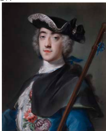
Rosalba Carriera, (1673–1757) Portrait of a Man in Pilgrim's Costume , ca. 1730– 50 Pastel on paper 31 1/2 x 27 x 3 1/4 inches Gift of Alexis Gregory, 2020 The Frick Collection, New York