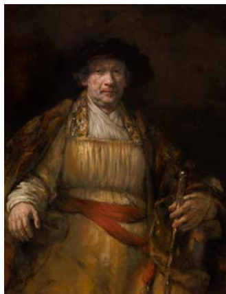
Rembrandt Harmensz. van Rijn (1606–1669) Self-Portrait , 1658 Oil on canvas 52 5/8 x 40 7/8 inches The Frick Collection, New York