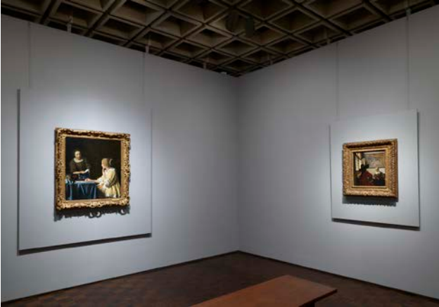
Room 6: Vermeer's Mistress and Maid (left) and Officer and Laughing Girl (right), as shown at Frick Madison by The Frick Collection