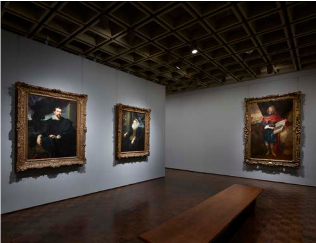
Room 5: Three of the Frick's eight portraits by Van Dyck, as shown at Frick Madison by The Frick Collection