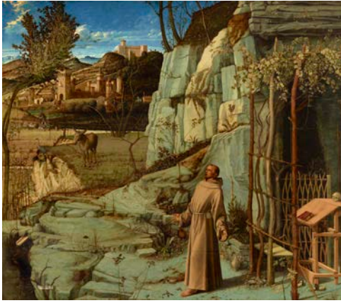
Giovanni Bellini, St. Francis in the Desert , ca. 1476–78, oil on panel, The Frick Collection, New York