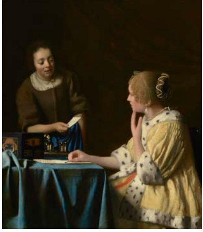
Johannes Vermeer, Mistress and Maid , 1666–67, oil on canvas, The Frick Collection, New York