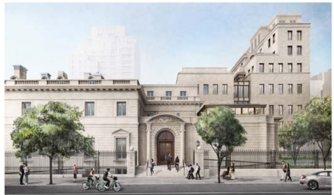
Rendering of The Frick Collection from East 70th Street

Honoring the architectural legacy and unique character of The Frick Collection, the plan designed by Selldorf Architects will provide unprecedented access to the original 1914 home of Henry Clay Frick, while preserving the intimate visitor experience and beloved galleries for which the Frick is known. Conceived to address pressing institutional and programmatic needs, the plan will create critical new spaces for permanent collection display and special exhibitions, conservation, education, and public programs, while upgrading visitor amenities and overall accessibility throughout the Frick's historic buildings. Preparatory work on the site will begin this fall, with construction scheduled to begin in the first quarter of 2021.