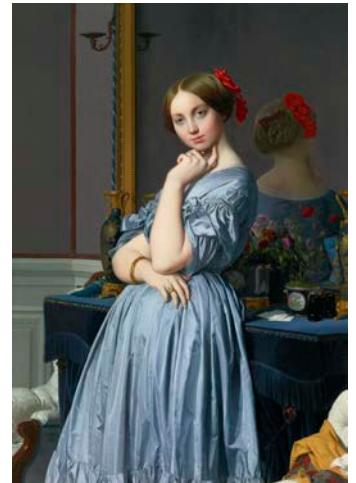
Jean-Auguste-Dominique Ingres, Comtesse d'Haussonville , 1845, oil on canvas, The Frick Collection, New York

exhibition will feature treasured paintings and sculptures by Bellini, Clodion, Gainsborough, Goya, Holbein, Houdon, Ingres, Piero della Francesca, Rembrandt, Titian, Turner, Velázquez, Vermeer, Whistler, and many others, alongside impressive holdings in the decorative arts. Rarely displayed works will include important seventeenth-century Mughal carpets and long-stored canvases from the famed series by Jean-Honoré Fragonard, to be shown together in its entirety for the first time in the Frick’s history.