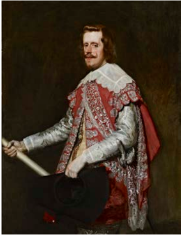
Diego Rodríguez de Silva y Velázquez, King Philip IV of Spain , 1644, oil on canvas, The Frick Collection, New York

The Frick Madison installation will be presented across three floors of the Breuer building, with paintings, sculptures, and decorative arts organized by time period, geographic region, and media. Highlighting strengths in particular schools and genres, the display will present the collection in galleries dedicated to Northern European, Italian, Spanish, British, and French art, setting the stage for rooms dedicated exclusively to works by individual artists, including