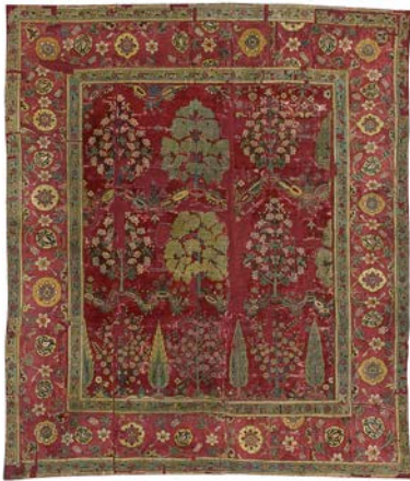
North Indian, Carpet , ca. 1630, silk (warp and weft) and pashmina (pile), The Frick Collection, New York

The installation will focus renewed attention on less familiar areas of the collection, including two seventeenth-century Mughal carpets, one of which is an especially rare and remarkable example. Removed from the mansion's domestic setting and thereby freed of the reminder of their practical function, these carpets will be hung on the walls like paintings, a display in keeping with their status as works of art of the highest quality. In the same manner, the installation will feature display areas and rooms dedicated by medium to significant works of French furniture, Asian and European porcelain, Renaissance bronze figures, portrait medals, French enamels and important European clocks. This mode of presentation will offer fresh insights on the breadth of decorative arts acquired by Henry Clay