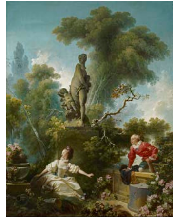
Jean-Honoré Fragonard, The Meeting (one panel in the series called The Progress of Love ), 1771–72, oil on canvas, The Frick Collection, New York

At Frick Madison all fourteen paintings of Fragonard's Progress of Love series will be displayed together for the first time in the Frick's history, including three panels that have been in storage much of the time since Mr. Frick purchased the set for his home in 1915. The series will be displayed to reflect its history, as it was created during two distinct campaigns, twenty years apart. The initial four canvases (1771–72) will be shown in a gallery adjacent to a room that displays the later ten canvases (ca. 1790–91), a temporary arrangement that has never been possible in the Frick mansion.