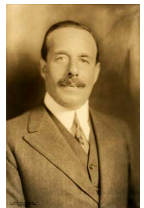
Sir Joseph Duveen, ca. 1920