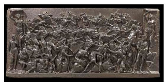
Bertoldo di Giovanni, Battle , ca. 1480–85, bronze, Museo Nazionale del Bargello, Florence

The five bronze reliefs displayed in the exhibition include scenes from the life of Christ to mythological festivities. They range in size from diminutive and intimate to the grand, arresting vision of a melee presented in the Battle , Bertoldo's largest bronze, which, according to modern scholars, is "the most important of [Bertoldo's] surviving works." The Battle is an imaginative reconstruction of a severely