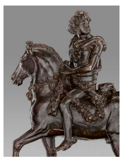
Bertoldo di Giovanni, Hercules on Horseback (detail), ca. 1470–75, bronze, Galleria Estense, Modena

September 18, 2019, through January 12, 2020