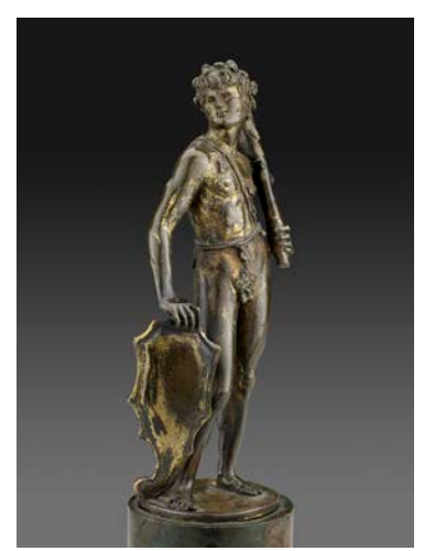
Bertoldo di Giovanni, Shield Bearer, ca. 1470–80, gilt bronze, The Frick Collection, New York

Bertoldo's artistic production in wood, metal, and terracotta is reconsidered, exploring the innovation of the sculptor's work across media revealing both his versatility as well as his ability to create a unified style, mediated through diverse scale, media, and hands. The objects shed light on his creative process—the development of a sculpture from idea to design to production—which has puzzled scholars for the past century. While certain stylistic elements unify his artistic output, the various materials used necessitated different approaches for their fabrication. It is clear, through documents and inscriptions as well as technical analysis conducted for the exhibition, that Bertoldo—not known to have had a workshop of his own—enlisted other artists to help transform his models into artworks. By bringing these sculptures together, the exhibition elucidates his role as a designer, modeler, and collaborator.