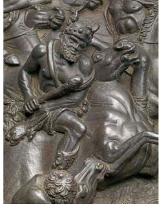
Bertoldo di Giovanni, Battle (detail)

traditional depiction of Romans fighting Barbarians, which is clearly delineated on the sarcophagus, and instead fashioned a scene of organized chaos in which the figures attack one another in seemingly endless combinations, with no underlying logic or allegiances. The central figure, adorned with the lion skin and club of Hercules as well as the helmet of Hermes, presents an identity that is as conflated and unclear as the battle itself. Bertoldo conceived of the relief with an unfixed narrative, thereby encouraging discussion amongst the viewers who attempted to discern its subject.