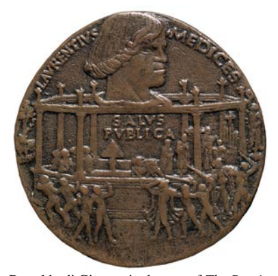
Bertoldo di Giovanni, obverse of The Pazzi Conspiracy (Lorenzo de' Medici) , 1478, bronze, Museo Nazionale del Bargello, Florence, Su concessione del Ministero per i beni e le attività culturali; photo Mauro Magliani

Bertoldo is known to have designed six medals, the prime examples of which are included in the exhibition. All of the medals demonstrate the sculptor's adept ability to present the convincing likeness of the sitter on the obverse accompanied by an inventive allegorical scene or incredibly detailed historical event on the reverse, an impressive feat given the relative nascence of this