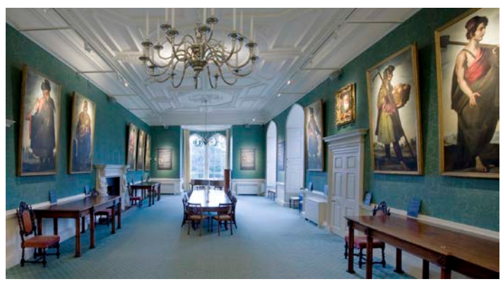
Zurbarán and other works on display in the Long Dining Room at Auckland Castle; photo credit: photo Colin Davison, courtesy of The Auckland Project

Francisco de Zurbarán helped to define Seville's Golden Age, a period of economic expansion and cultural resurgence in the late sixteenth and early seventeenth centuries, when the Andalusian seaport monopolized trade with the New World. Throughout