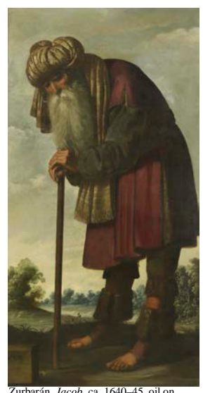
Zurbarán, Jacob , ca. 1640–45, oil on canvas, 79 1/8 x 40 5/16 inches (201 x 102.4 cm)

Christianity, Jacob is seen as a prefiguration of Christ, and his sons as antecedents of the twelve apostles. Zurbarán's primary biblical source for the paintings was the "The Blessings of Jacob," a prophetic poem in Chapter 49 of Genesis. In developing the iconography of the series, Zurbarán also drew from visual sources. A posthumous inventory of his studio revealed some seventy sixteenth- and seventeenth-century northern European prints that he mined for poses and gestures for this series and other works, as well as costume elements and attributes. For the Auckland paintings, Zurbarán turned largely to engravings depicting Jacob and his twelve sons that were executed in 1589 by Jacques de Gheyn II, after designs by Karel van Mander I. The expressive and highly distinctive faces of each son, however, suggest that they were painted from life. On canvases measuring nearly seven feet in height, full-length figures wearing sumptuous, exotic costumes tower over varied landscapes. Each son is rendered with a strong sense of individuality, while forming part of a cohesive, choreographed group, as if participants in a procession. The works are unsigned, indicating