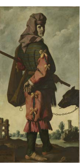
Zurbarán, Benjamin , ca. 1640–45, oil on canvas, Grimsthorpe Castle, Lincolnshire

as well as the rod and document he holds, denote his status as a viceroy in the court of the Egyptian pharaoh (see illustration on front page). In contrast to Joseph's stately posture and rich attire, Benjamin, the youngest son, is depicted in country dress in an