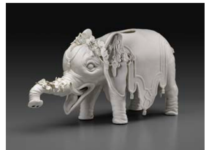
Du Paquier Porcelain Manufactory, Elephant Wine Dispenser, ca. 1740, Du Paquier porcelain, The Frick Collection, gift from the Melinda and Paul Sullivan Collection, 2016; photo: Michael Bodycomb

Fired by Passion will present about forty tureens, drinking vessels, platters, and other objects produced by Du Paquier between 1720 to 1740, which were coveted by aristocrats in Vienna and throughout Europe. In addition to exploring the rivalry between the Du Paquier and Meissen manufactories, the exhibition will highlight the eclectic mix of references—many of them East Asian—that inspired Du Paquier porcelain. Splendid examples with coats of arms and heraldic symbols from commissions across Europe will also illustrate the manufactory's success and influence beyond Vienna. Fired By