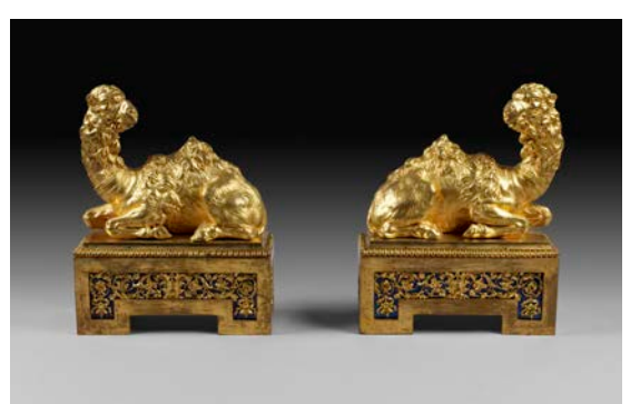
Pair of firedogs, Pierre Gouthière, 1777, gilt bronze and blued steel, Musée du Louvre, Paris; photo: RMN-Grand Palais/Art Resource, NY

"African heads." Only the firedogs and chimneypiece (still in situ at the Château de Fontainebleau) have survived. A firedog is the decorative façade of an andiron, a metal support that holds burning wood in a fireplace. The design of these examples, in the shape of seated dromedaries, was in keeping with the oriental decorative theme of the Cabinet Turc, which was meant to transport the queen into a world of fantasy, sensuality, and refinement. The bases are adorned with an elegant arabesque frieze characteristic of the neoclassical style favored by the queen.