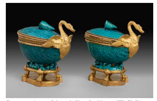
Two pot-pourri vases, gilt bronze by Pierre Gouthière, ca. 1770–75, Chinese hard-paste porcelain, eighteenth century, Musée du Louvre, Paris; photo: RMN-Grand Palais / Art Resource, NY

In the 1770s and 1780s, the elite of Paris were eager for Gouthière's work. Jean-Baptiste-Charles-François, Marquis of Clermont d'Amboise, may have commissioned the pair of pot-pourri vases from Gouthière in the early 1770s before he left for the court of Naples, where he served as ambassador from 1775 to 1784. Achieved by employing a range of treatments of the bronze, the naturalism of the swans is particularly impressive. Their flashing eyes express fury: as if about to attack, they raise their wings on either side of the porcelain pots. Their aggressive