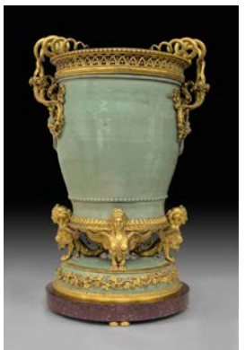
One of a pair of vases, gilt bronze by Pierre Gouthière after a design by François-Joseph Bélanger, 1782, eighteenth-century Chinese celedon hard-paste porcelain, porphyry, Musée du Louvre, Paris; photo: Joseph Godla

On a pair of Chinese vases (originally used as garden seats), Gouthière created for the Duke of Aumont mounts after a complex design by François-Joseph Bélanger, whose composition of arabesques, snakes, and harpies was considered the height of fashion in the 1780s. Gouthière's gilt-bronze interpretation of the architect's design shows his command of the medium. The snakes' backs are chased to create the illusion of small scales, while their bellies feature larger scales to imitate the skin of a live snake. Although bronze makers usually attached their mounts to porcelain by drilling holes in it, Gouthière again demonstrates his virtuosity by creating mounts that fit securely on the vases without piercing the fragile ceramics.