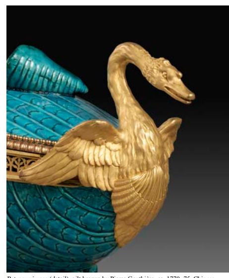
Pot-pourri vase (detail), gilt bronze by Pierre Gouthière, ca. 1770–75, Chinese hard-paste porcelain, eighteenth century, Musée du Louvre, Paris; photo: RMN-Grand Palais / Art Resource, NY

November 16, 2016, through February 19, 2017