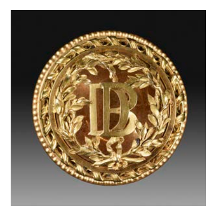
Knob for a French window, Pierre Gouthière after a design by Claude-Nicolas Ledoux, gilt bronze, ca. 1770, Musée des Arts décoratifs, Paris

depicting The Progress of Love, painted for the same room and now in The Frick Collection, attest to the pavilion's former glory. Each myrtle leaf, a symbol of the goddess Venus, is rendered in exquisite detail, forming a sort of lacework that contrasts with the smooth surface of the interlinked D and B , the royal mistress's initials. The knob alone confirms the recollections of the painter Élisabeth Vigée Le Brun, who, writing in the 1830s about her time spent in Du Barry's residence decades earlier, recalled that the "salon was ravishing … the chimneypieces, the doors, everything was fashioned in the finest possible way; even the locks could be admired as masterpieces of the goldsmith's art."