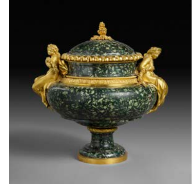
Vase, gilt bronze by Pierre Gouthière, green Greek porphyry possibly carved by Augustin Bocciardi or Pierre-Jean-Baptiste Delaplanche, alter a design by François-Joseph Bélanger, ca. 1775-80, Musée du Louvre, Paris

together twenty-one of his finest masterpieces, drawn from public and private collections across Europe and the United States. Many of these remarkable objects—from firedogs, wall lights, and doorknobs to elaborate mounts for rare Chinese porcelain and precious hardstone vases—have never before been shown publicly in New York, and their assembly in an exhibition will provide the basis for a fresh understanding of his oeuvre. With new art historical and technical research by leading experts in the field, the exhibition and accompanying catalogue shed