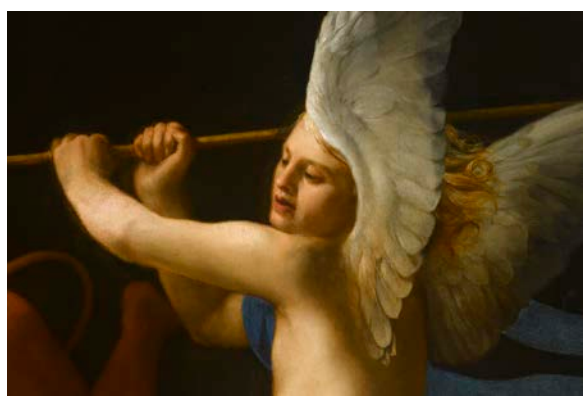
The Repentant Magdalen (detail), ca. 1660–63, oil on canvas, 90 1/4 \times 104 \times 3/4 inches, Norton Simon Art Foundation, Pasadena, California

The Repentant Magdalene is Cagnacci's most ambitious canvas and is rightly considered one of his most important works. Highly theatrical in composition, the painting is based on contemporary literary sources and on religious plays inspired by biblical texts. The scene is set in a large room, lit from a window on the left and from a door to the right; the columns and balustrade of the balcony beyond denote the house as an aristocratic residence. A terracotta pot on the balustrade holds a carnation plant, the flowers of which have yet to blossom. The room is richly