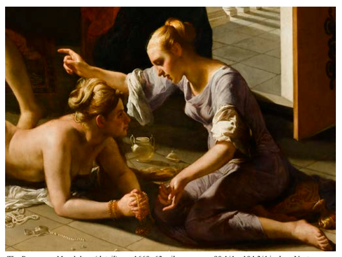
The Repentant Magdalene (detail), ca. 1660–63, oil on canvas, 90 1/4 x 104 3/4 inches, Norton Simon Art Foundation, Pasadena, California

decorated, with a tiled floor, an Eastern carpet, and three red and gold damask cushions.