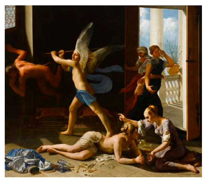
Guido Cagnacci (1601–1663), The Repentant Magdalene , ca. 1660–63, oil on canvas, 90 1/4 x 104 3/4 inches. Norton Simon Art Foundation, Pasadena, California

October 25, 2016, through January 22, 2017