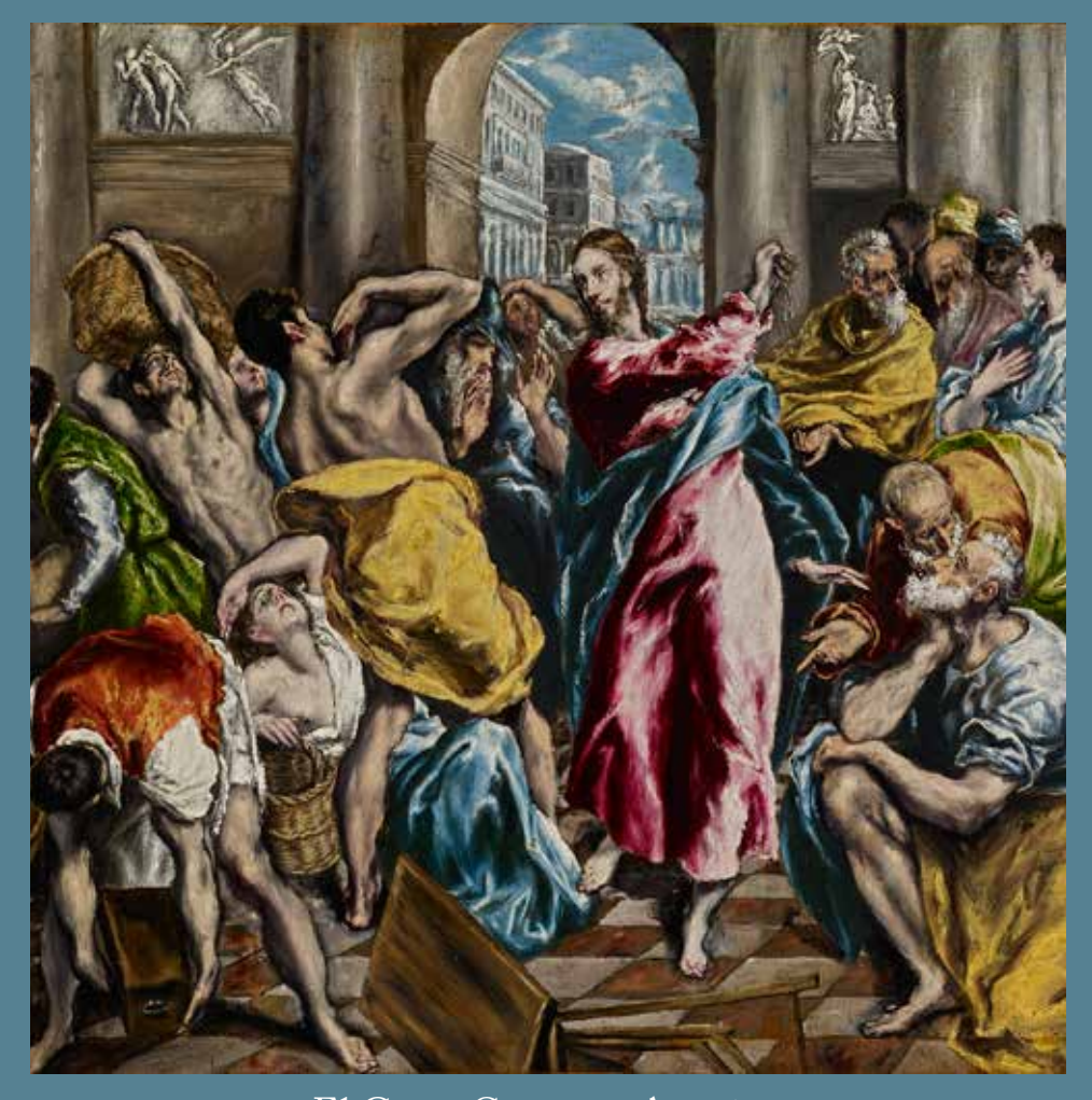
El Greco Comes to America: The Discovery of a Modern Old Master